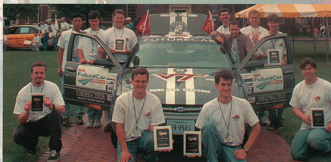
University of Wisconsin and Virginia Tech tied for 1st Place Overall.