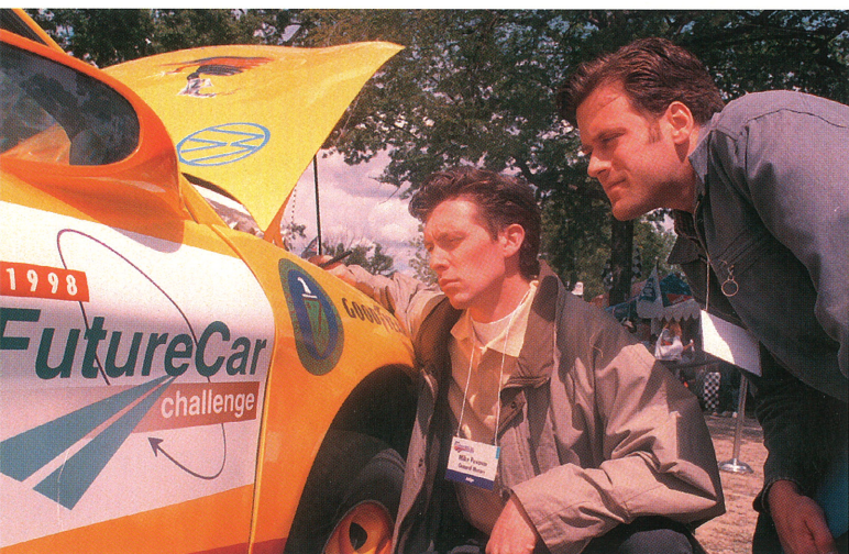
Automotive stylists from GM judging vehicle appearance.

Also, each year the competition has attracted more attention from the news media. This year, Popular Mechanics , Popular Science , Ward's Automotive , Automotive Industries , The Car Connection , and Automotive Engineer covered the event. Several televised segments appeared on nightly news programs, and USA Today included two front-page placements on the Challenge.